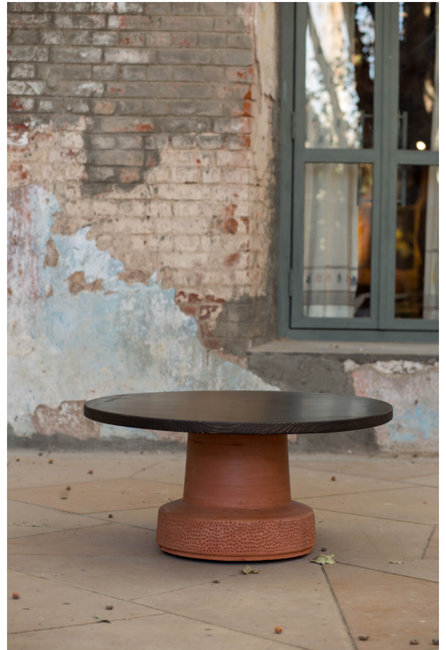
Terracotta Cylinder Center Table Di 36" H 16"