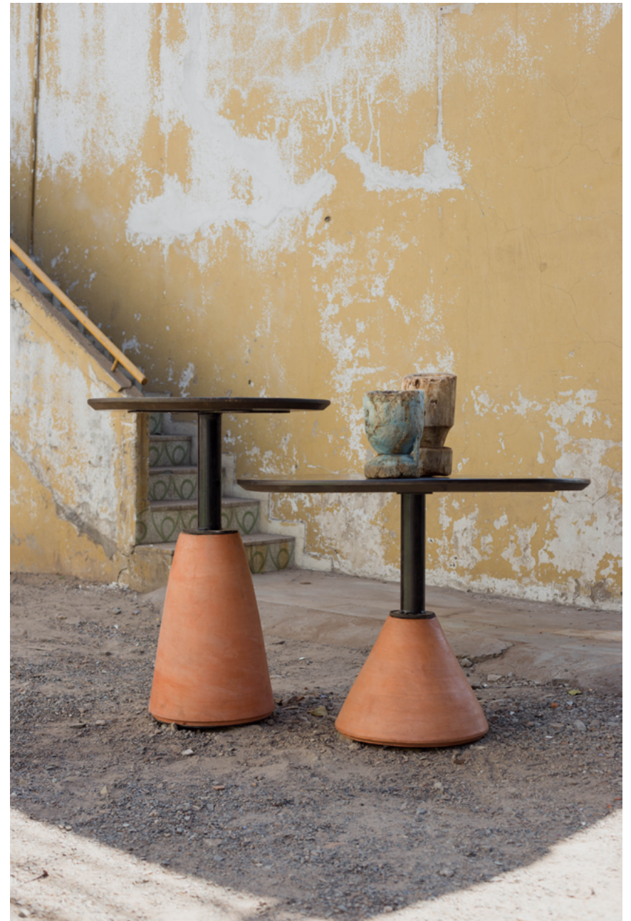
Terracotta Cone Bar Table Di 24" H 36"