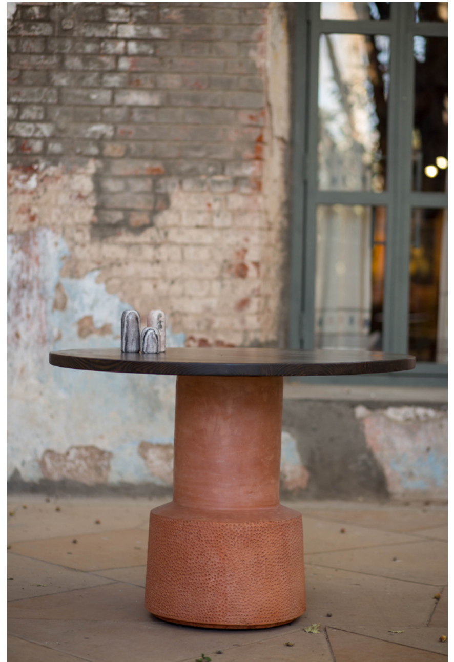
Terracotta Cylinder Center Table Di 36" H 30"