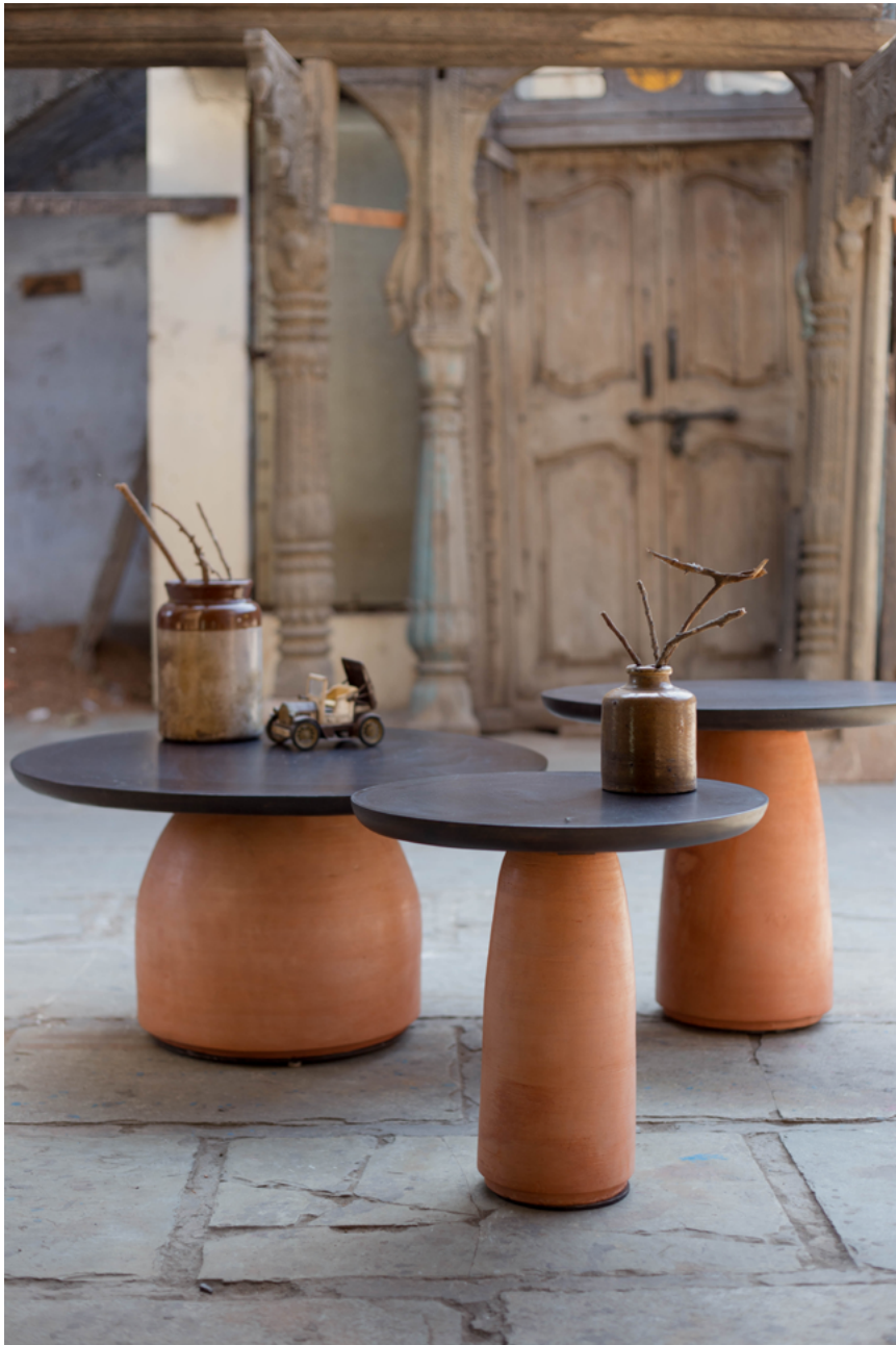
Terracotta Elliptical Center Table Di 30" H 16"