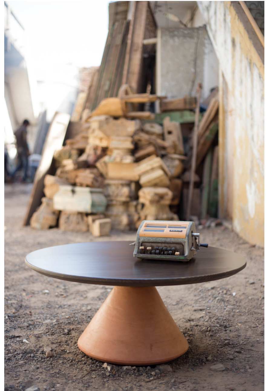
Terracotta Cylinder Center Table Di 36" H 16"